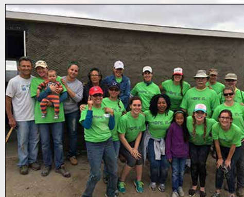
2016 AMOR Mission Trip