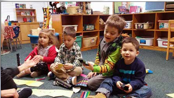
Sunday School Fun