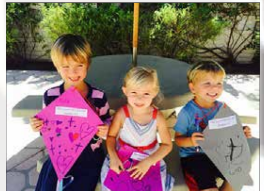
Sunday School from August 2015