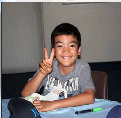
2015 Vacation Bible School