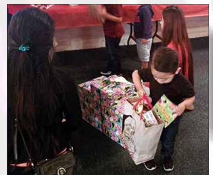
2016 Angel Tree Party