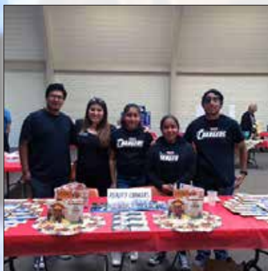
Spirit of Christmas Fair 2015