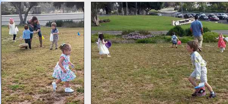
Easter Egg Hunt 2016