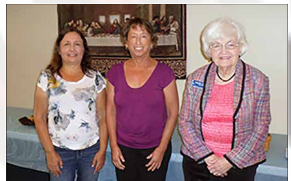
Deacons Hosted Calvin's Coffeehouse in April