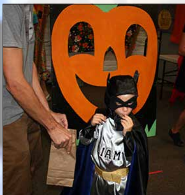
All Hallow's Eve 2015