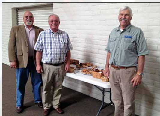
Men's Fraternity Hosted Calvin's in April