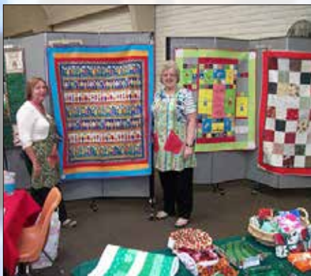
Presbyterian Women's Boutique & Bake Sale 2015